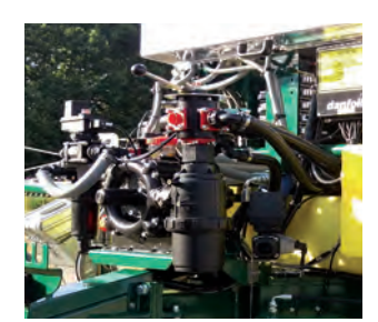
Pump for agitation of the tank (extra equipment)

Danfoil only uses approved storage tanks for the chemicals. They are available in either 28 I or 100 I. The tanks can be delivered with or without agitator and will be mounted on specific platforms.