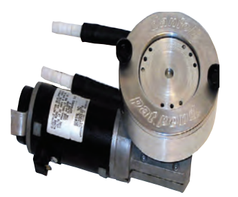
Danfoil injections pump

The Peristaltic pump is very precise and robust, it is easy to maintain.