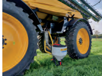
Capacity 153-220 ha.

Low weight gives danfoil Airforce 1 a Unseen capacity, from 153 ha/4.600 l major advantage compared to convento 220 ha/6.600 I nothing like it on the tiobnal sprayers.